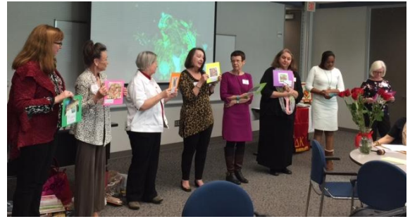
Members provide fun facts about some typical African food items.