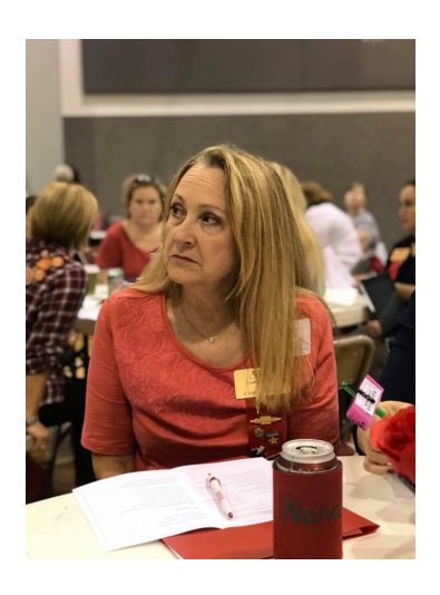
Area 18 Workshop Recap